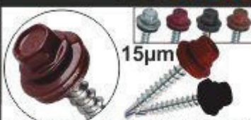
cel mai bun pret